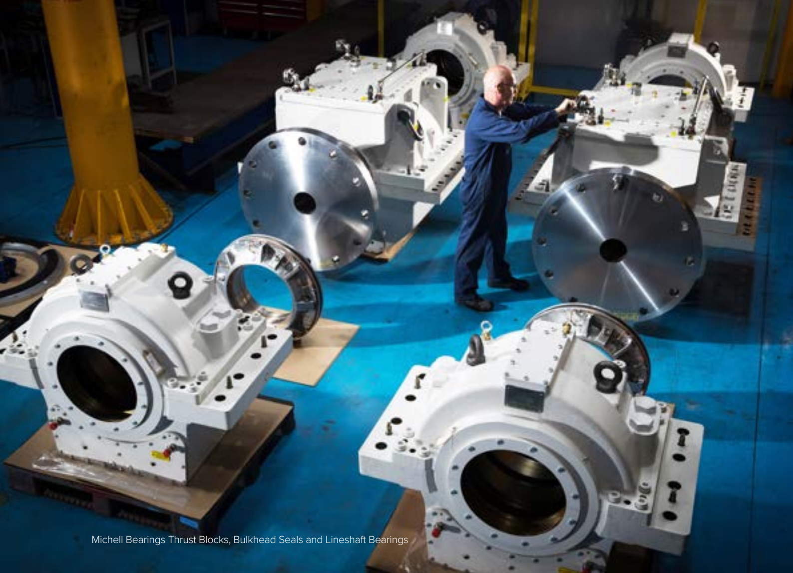
Michell Bearings Thrust Blocks, Bulkhead Seals and Lineshaft Bearings