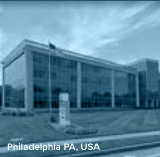
Philadelphia PA, USA

Michell Bearings Waldridge Way Simonside East Industrial Park South Shields Tyne and Wear NE34 9PZ