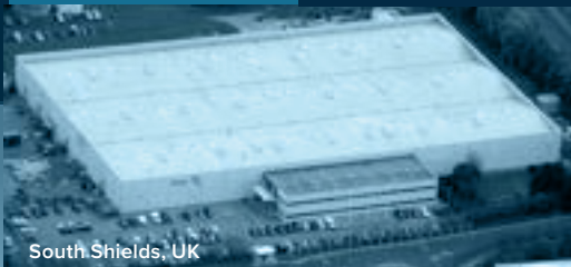
South Shields, UK

© Michell Bearings Inc. 2023. All images and text, along with any intellectual property rights, contained in this catalogue are owned by Michell Bearings Inc. and may not be used, reproduced or manipulated without the written permission of Michell Bearings Inc. The information contained in this catalogue is illustrative only. Michell Bearings Inc. shall have no liability or responsibility in respect of reliance on the information contained in the catalogue. The information contained in the catalogue shall not form part of any contract subsequently put in place. We reserve the right to revise this document at any time, please check the Michell Bearings Inc. website for the latest revision.