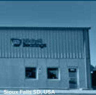
Sioux Falls SD, USA